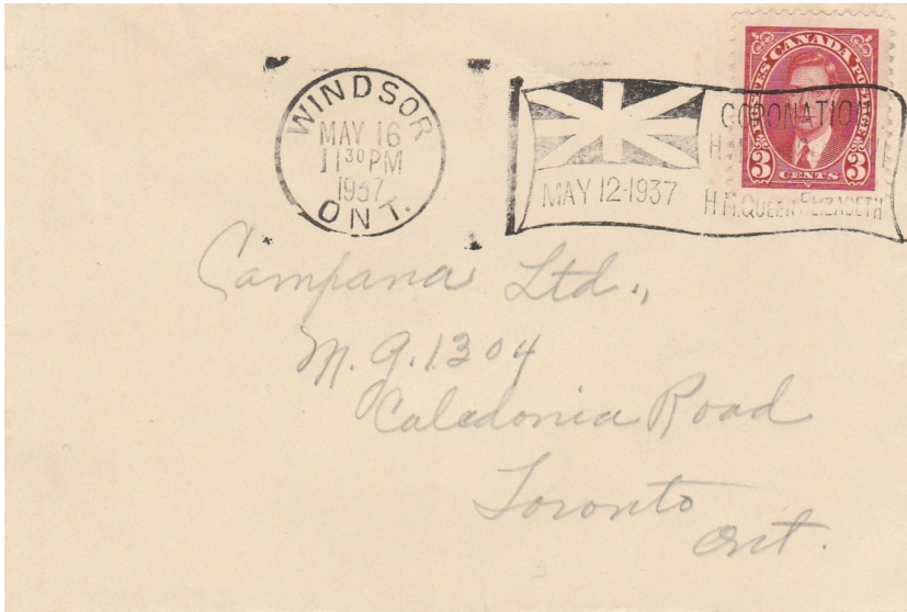
Fig 9 Sunday, May 16. This example is timed at 11.30 PM yet there were, in all probability, a number of occasions throughout the day, when the machine would have been operated. The question must be asked 'where are other examples with earlier times?