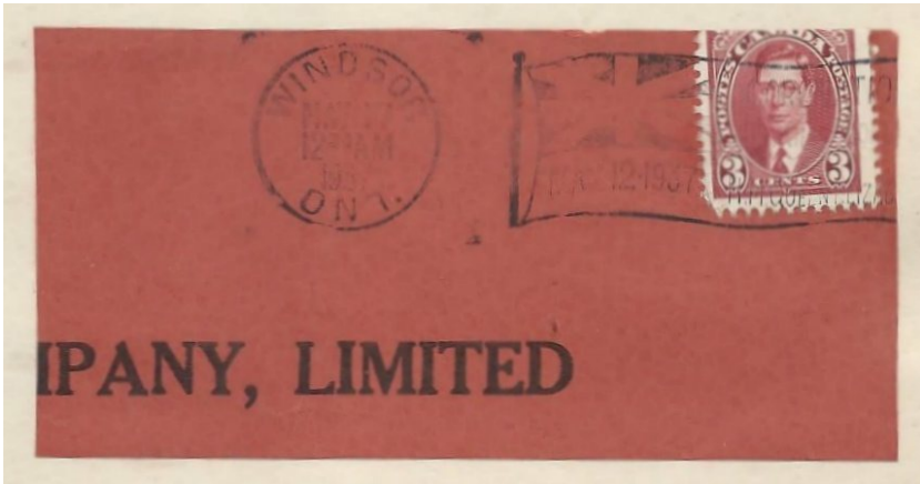
Fig 11 Whilst a feint impression, this is dated May 17 and timed at 12.30 AM. This is surmised to be the time when it was noticed that the Coronation slogan was still in situ.