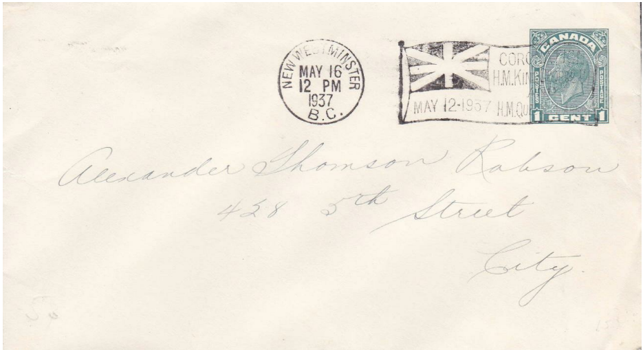
Fig 1 A postal stationery 1 cent cover timed at 12PM (i.e. noon) being the city 'drop' rate. This was more than likely the earliest time the machine was used to justify the amount of uncanceled mail.

New Westminster. This office probably had very little mail to process on a Sunday in 1937 which resulted in a number of envelopes/cards being cancelled for the 16th as evidenced by the covers below.