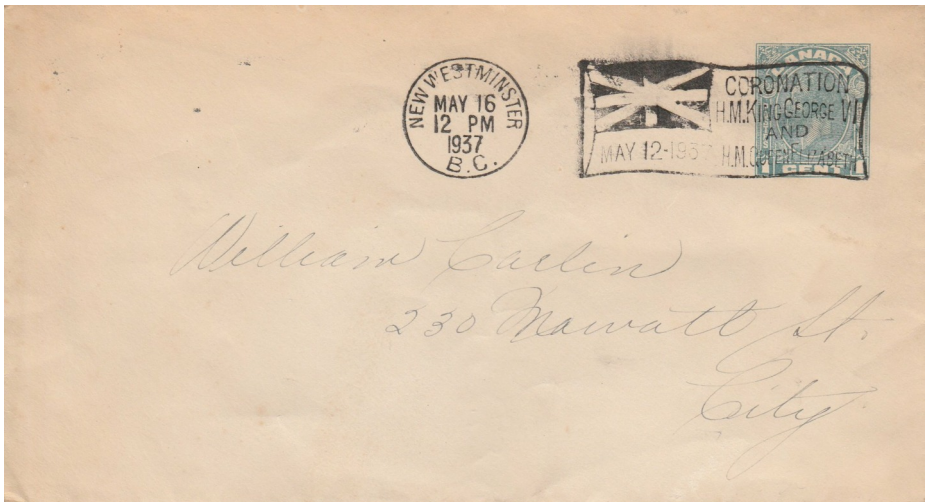
Fig 2 An almost identical drop letter cover with the same handwriting, but to another addressee, also timed at 12PM. The sender was a James Shrimpton (inked rubber h/s on reverse) of South Burnaby. The author believes that at least one more cover of a similar nature exists.