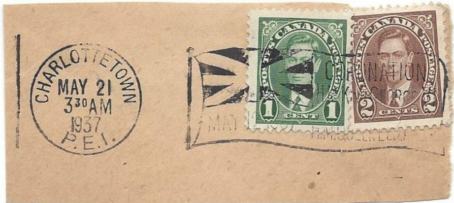
Fig 12 If only this date appeared on a complete envelope which may have offered a clue as to how this came about.