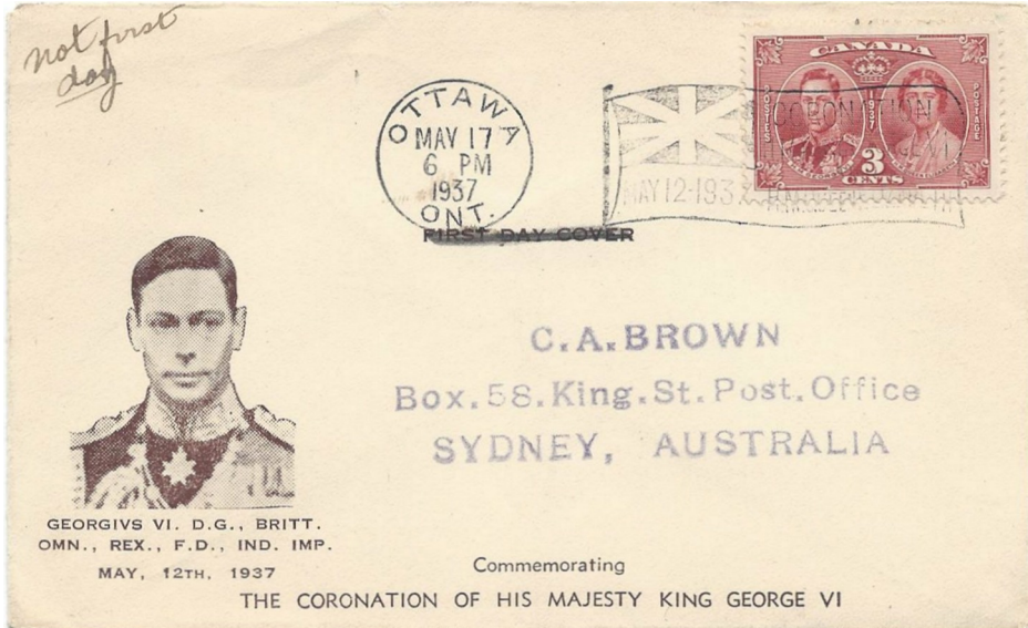
Fig 6 Cover from Ottawa with May 17 date.

Ottawa. The latest date from Ottawa is a cover dated May 17 which is addressed to Sydney, Australia. There has been much discussion on how this occurred with the most plausible being that it was a 'by favour' cover for someone who had not posted it (probably to himself) during the previous week. The clerk managed to find the slogan, which had been removed at the end of day on Saturday 15th, placed it into the machine, but forgot to correct the dater hub. To date, there has been no record of any other cover bearing either May 16 or 17 dates, reinforcing the theory described.