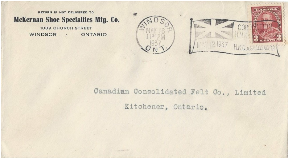
Fig 10 Another example from May 16 with the 11.30 PM timed dater hub. During the previous week there were other times of using the Perfect machine, even discounting the 10th (first day of the Coronation stamp and 4, 5 and 8 cent Mufti stamps) and 12th (the day of the Coronation) when it was used indicating that there was a demand for an automated process rather than hand-stamping.