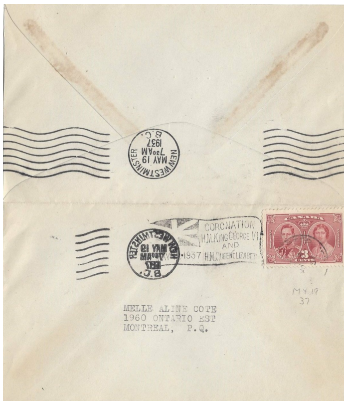
Fig 4 A most unusual cover with more questions than answers. It is dated May 19 and whilst the slogan just ties the Coronation stamp, there does not seem to be a dater hub impression, hence the necessity for the circular date stamp cancelling the adhesive, timed at '3'.

Were the sorting clerks servicing the machine and then noticed that the Coronation slogan was still in situ, removing this and replacing it with the default wavy line canceller?