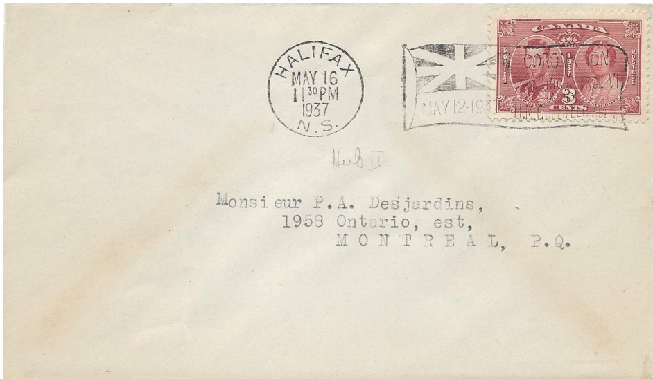
Fig 5 Two covers from Halifax N.S. With May 16 dates.