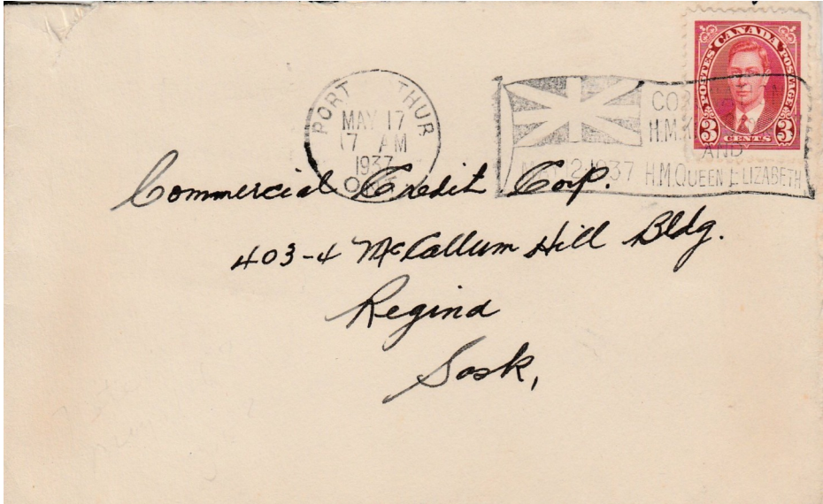
Fig 8 Dated May 17 timed at 7 AM. A full 24 hours later and the slogan error had still not been picked up, even though the dater had been changed. One other cover is known to the author, as there is a facsimile appearing in the 'Flag Pole' news letter (4) also addressed to the Commercial Credit Corp., Dated May 16 but timed at 7.30 PM. One speculates that the error was quickly discovered on the Monday.